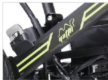
Aluminum alloy frame