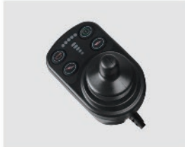
YSPC002 Controller (brushless)