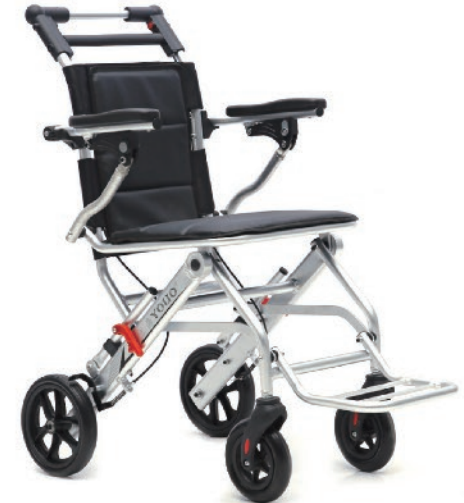
YML121 Lightweight aluminum wheelchair