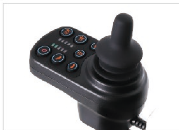
Intelligent universal controller