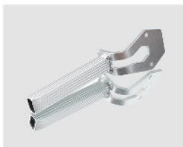
YSPAC002 Controller holder (short)