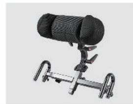
YSPHR001 Headrest, Angel adjustable