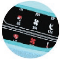
Electronic display screen