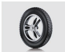
YSPW1205 12.5" PU Solid wheel