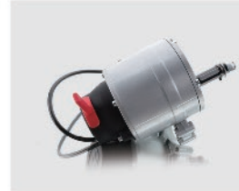
YSPM004 250W Brushless Motor