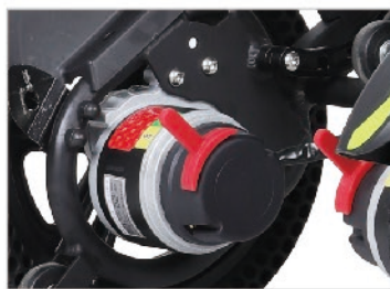
Manual / electric mode switch