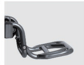
YSPFR002 Footrest assembly