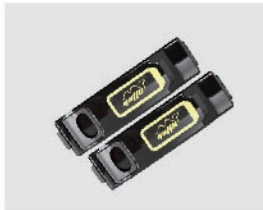
YSPBL360 6Ah/9Ah Quick removable