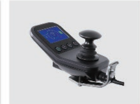
YSPC005 Controller (LED screen)