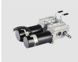
YSPM005 320W D.C Motor