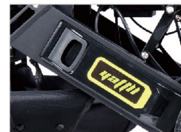
Quick release battery design