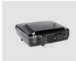
YSPBL210 11Ah/15Ah Quick removable