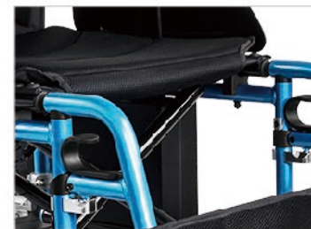
Swing away footrest