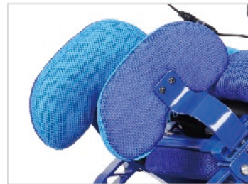
Soft & comfortable leg guard pad