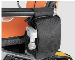
YSPBG11 Armrest sidebag