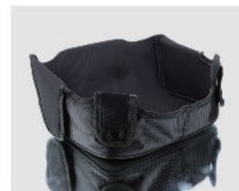
YSPBG12 Storage bag