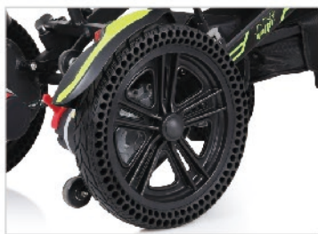
Suspension wheel,rubber material