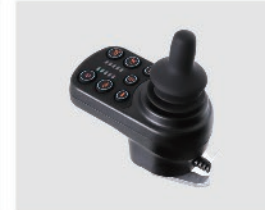
YSPC004 Controller (Reclining)