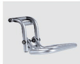
YSPFR001 Footrest assembly