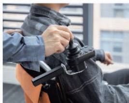
YSPAC001 Bracket for Rear Controller