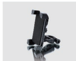
YSPPH001 Phone holder