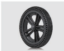
YSPW1204 12" Suspension wheel