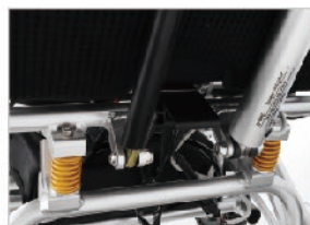
Rear suspension system