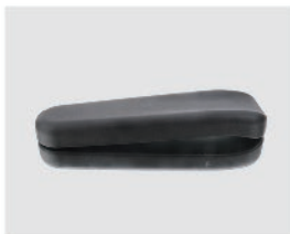
YSPAR001-A02 Curved PU arm pad