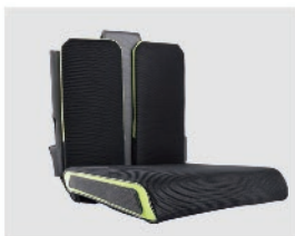
YSPSU002 Foamed upholstery