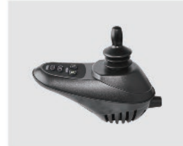
YSPC001 Controller (brushed)