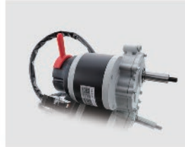
YSPM001 250W Brushed Motor