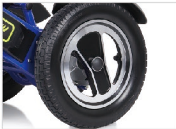
Anti puncture solid wheel