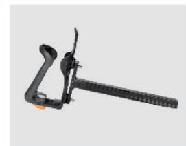
YSPCH001 Cup holder