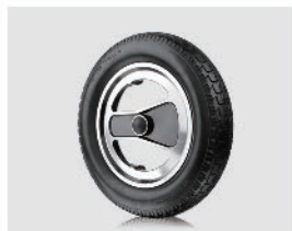
YSPW1202 12.5" PU Solid wheel