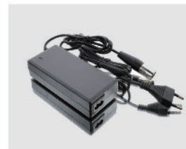
YSPCG203 2A Charger for Lead acid battery