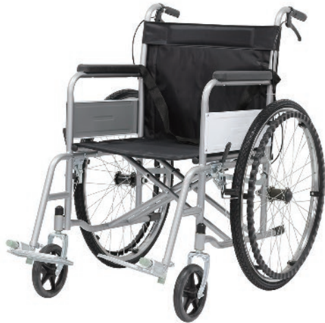
YE119 Steel wheelchair