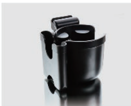
YSPPH002 Cup & Phone holder