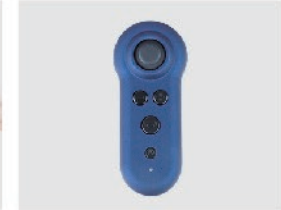
YSPCR001 Remote control