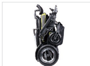
Compact folding space