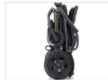
One step fold