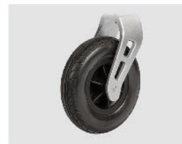
YSPW701 7" PU Solid wheel