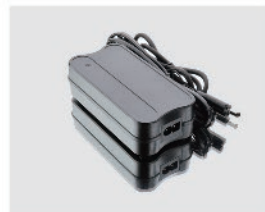
YSPCG212 YSPCG313 / YSPCG515 2A/3A/5A Charger