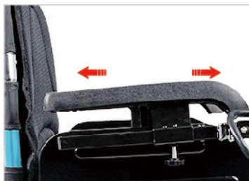
Armrest move forward and backward