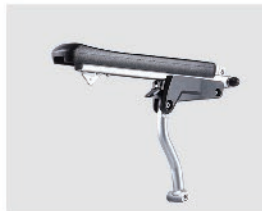
YSPAR001 Armrest assembly (L&R)