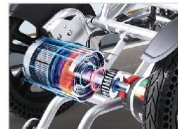
Brushless motor 250W each