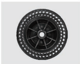
YSPW803 8" PU Solid wheel