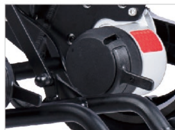
Electric/Manual Mode switch