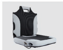
YSPSU001H Heating upholstery