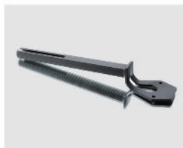
YSPAC002 Controller holder (long)