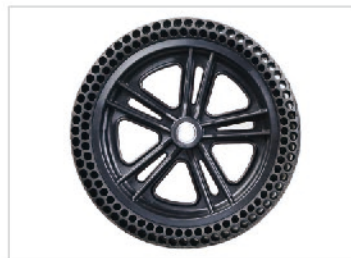
Front& rear perforated wheels