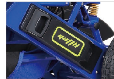
Quick-released battery design