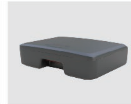
YSPBL401 26Ah One click removable