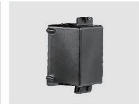
YSPLA11 12Ah Lead acid battery