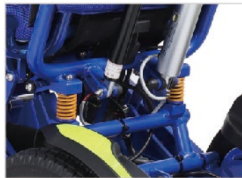
Suspension system on back frame