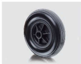
YSPW801 8" PU Solid wheel