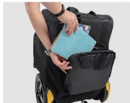
YSPBG10 Travel bag