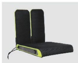
YSPSU002H Heating upholstery