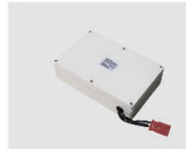
YSPBL110 / 150 / 200 Lithium battery