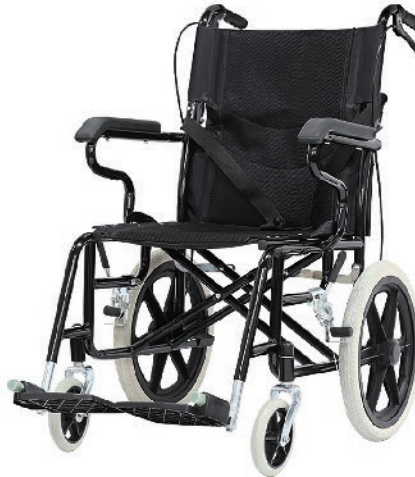
YML120 Steel Wheelchair