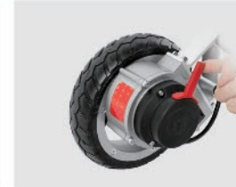
YSPM002 250 Brushless Motor