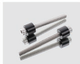
YSPWK52 YSPWK56 Seat width widening kit