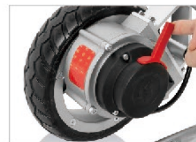
Manual/ Electric mode Switch