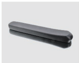
YSPAR001-A01 PU arm pad