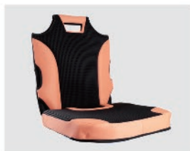
YSPSU001 Foamed upholstery