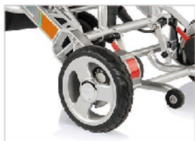
Top-quality brushless motor