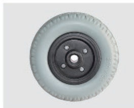
YSPW804 8" Heavy duty wheel