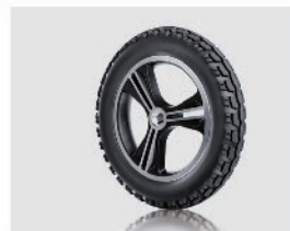
YSPW1206 12.5" PU Solid wheel